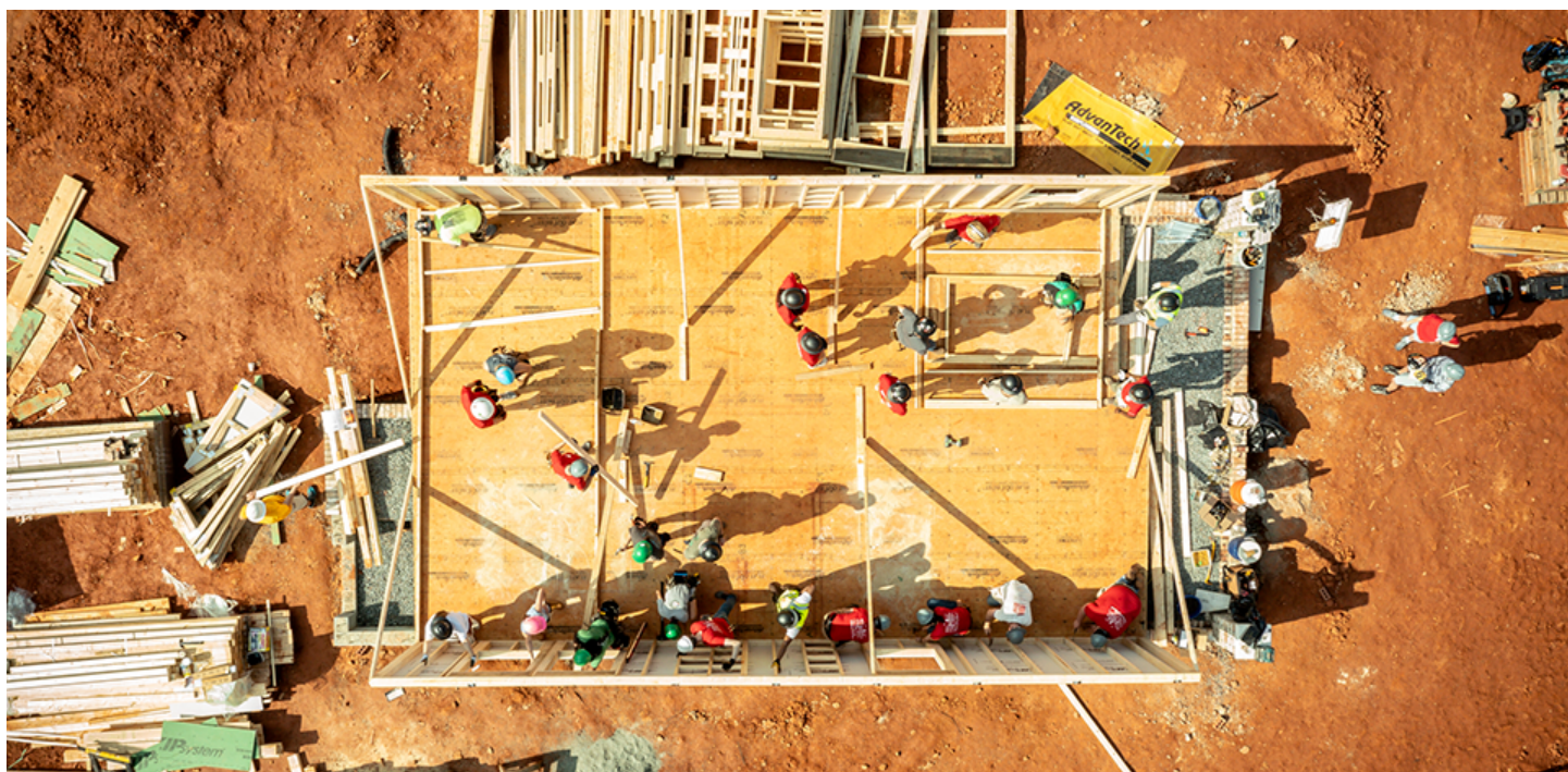
Drone footage of homes underway in Meadows at Plato Price

Lucky 13 --The number of Homeowners-in-Process who have selected lots for homes in Meadows at Plato Price out of the 23 total homes volunteers will work on October 1-6.